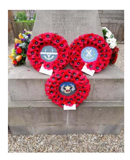
Seaforth Highlanders, Cameron Highlanders and Cameronians wreaths.