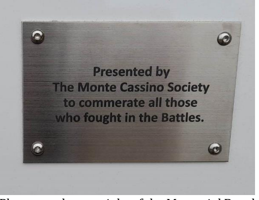
Plaque on the top right of the Memorial Bench