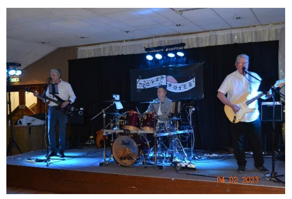
The Cover Notes