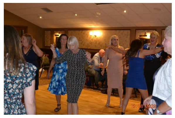
\label{eq:def:Didn't} \mbox{Didn't take long for the dance floor to start filling up}\,.