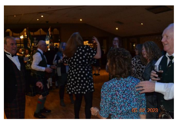
Members and guests enjoying the evening.